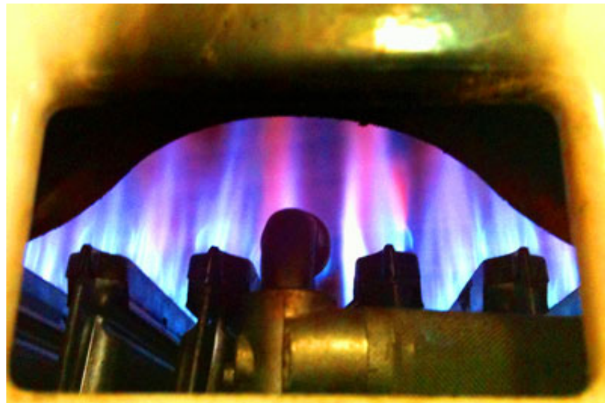
Gas Flames afire

In mid April of 2009, I came to Buenos Aires to study song and dance. I came here for the tango and to complete my novel. I came here ready and eager to begin a new life with my cat Dusk, my constant companion. This was not my first trip to Buenos Aires – it was my ninth trip here. But this time, I planned on staying for half a year or more.