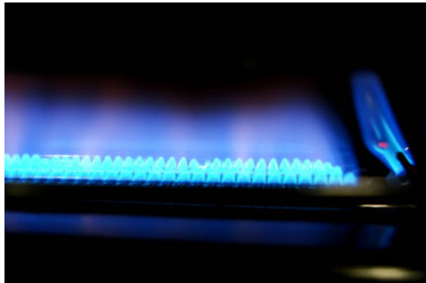
Gas Heater all lit up

He turned off the gas to the apartment, and said that until the repairs were done by the owner, the gas would not be turned on again. I told him I was moving the next day. He said that if I had not called, the person who lived here after me would have died.